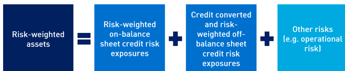
Figure 1. Standardised RWA calculation under APS 110

Under APS 110, the minimum CET1 capital requirement is calculated as 4.5 per cent multiplied by RWA, where RWA is determined as per Figure 1.